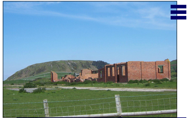
Abandoned and derelict military buildings at Tonfanau

All that you can see here are the remains of a long-gone army base . Built in 1938 and demolished in the mid 1980s, a couple of walls and some foundations remain.