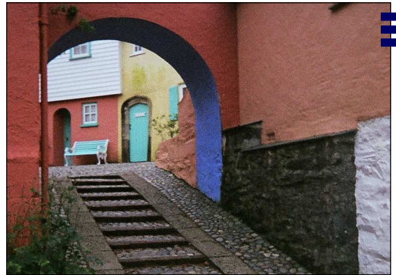
Colourful street scene at Portmeirion

Criccieth Castle is perched on a hill above the beach and although somewhat smaller than Harlech's it's still quite a nice, picturesque little place.