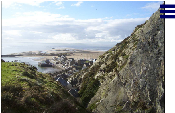
Barmouth viewed from the cliffs above

The open hillside of Dinas Olau was the first piece of land to be owned by the National Trust.