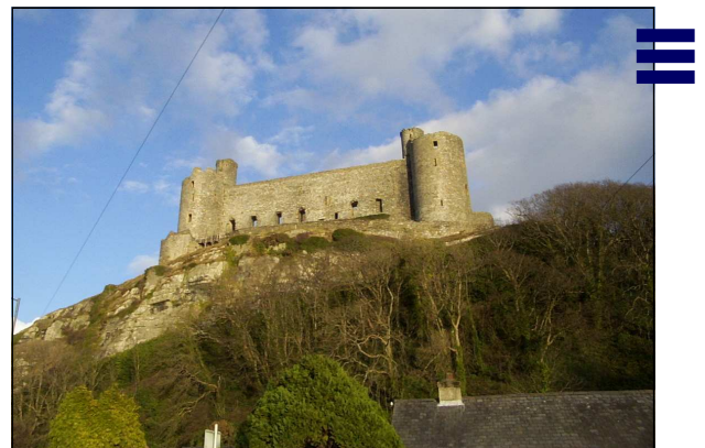
Harlech's mighty castle looms large

If you've made the steep climb up to the castle, you can also explore the village - there are a couple of small shops that could be worth a browse, and there's also a viewpoint looking out over the Irish Sea that is mentioned in the Welsh 'Mabinogion' legends .