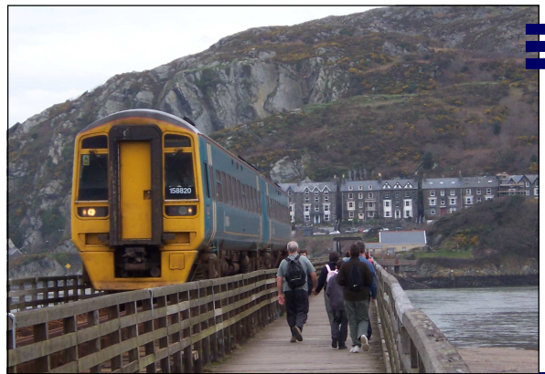
Crossing Barmouth Bridge