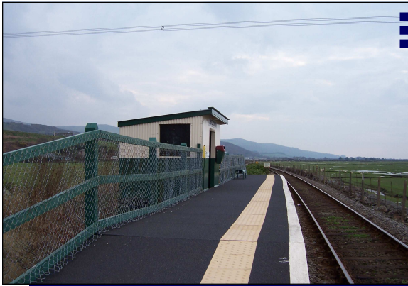
The tiny little Llandecwyn station