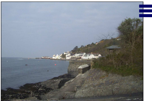
View towards Aberdovey from the rocks near Penhelig

The large sandy beach and dunes near Aberdovey station enjoy superb views across the Dovey Estuary to Ynyslas. Also worth an explore is the estuary path which clambers along the rocky banks of the Dovey (or Dyfi) River from the gardens by Penhelig station.