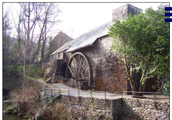
The Dyfi Furnace

A twenty minute walk from the station (turn right upon reaching the main road) takes you to the village of Eglwysfach for the Ynyshir Nature Reserve or, a little further on, the picturesque Dyfi Furnace .